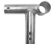
Offset Leg Joint

The French Wall MeshPanel may be set up at almost any point along the wall. More than one French Wall can be used to increase your display space. Placing a French Wall 2-3ft from the back wall will create a protected space to use for inventory storage or for a sales desk.