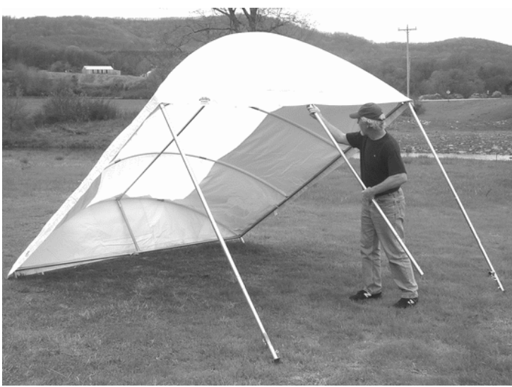
Front legs attached, removing the leg