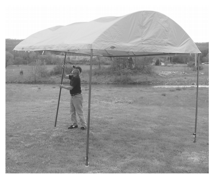
Pushing rear edge ogframe up using leg

<u>A word of caution for windy days:</u> All canopies are vulnerable to wind gusts until they are securely tied or weighted down. Be especially careful while you have the front legs installed and the back edge of the canopy resting on the EasyRiser pole. Ask a neighbor to help hold it down while you finish installing the legs.