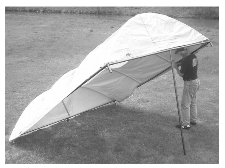
Canopy roof raised and supported on leg