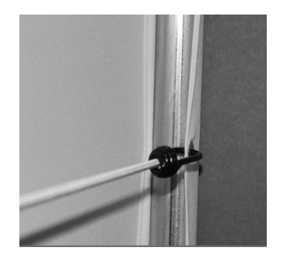
Curtain wrapped around leg, with bungee hooked through eyelet

Finish by attaching the back panel to the bungee hooks along the rear legs. This means that the hooks along the rear legs will each be receiving two eyelets – first the eyelet from the side panel, then the eyelet from the back panel. (There will not be bungees stretched across the outside of the back panel.)