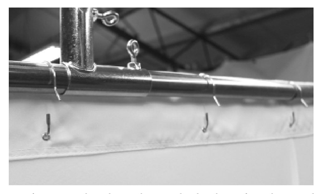
Top of curtain with eyelets and curtain hooks, shown from the outside

If you have eyelets and curtain hooks at the top of the panels: hook curtain hooks over the top bar of the booth frame.. Be sure the panel marked "back" is placed at the back of the booth.