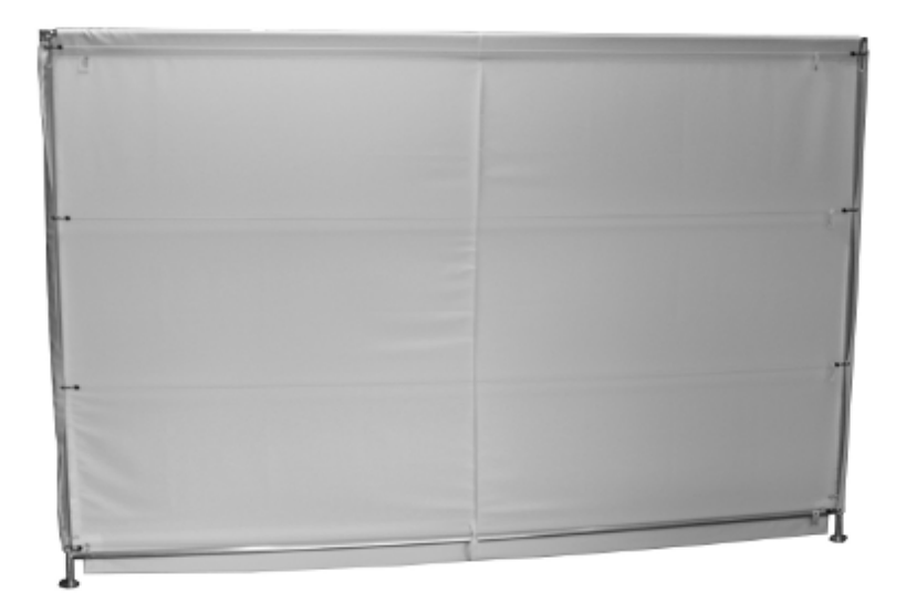
Outside of side panel, showing bungees

Begin with the side panels, wrapping the edge of the panel around the leg of the frame and stretching a bungee between each set of eyelets. For a 7' wall there are four sets of eyelets. For an 8' wall there are five sets of eyelets.