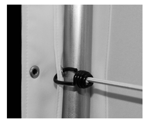
Side curtain hooked, back curtain ready to be hooked into same bungee hook

4. Stretch the vertical mid-seams gently by tying ribbon ties to the lower horizontal pole of the booth frame.